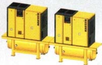
Duplex in end-to-end configuration for narrow aisles or against a wall (as shown)