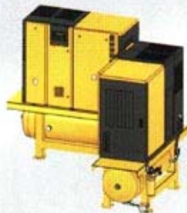
Duplex in corner arrangement (as shown)