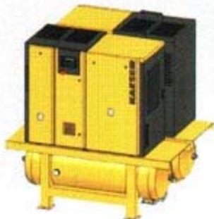
Duplex back-to-back arrangement for room center installation (as shown)

NOTE: SK/AS duplex systems include a connection piping kit.